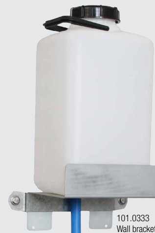
101.0333 Wall bracket